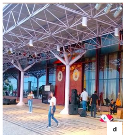
a) Instrumentalists from the Frutos do Pará Group in presentation. b) Musicians with two curimbós from the Charme Caboclo group. c) Perspective of a place that could be the reference center for the carimbó heritage in Icoaraci. d) Carimbó presentation area in the Estação das Docas tourist complex.

Source: a) Collection of the Group, 2018, kindly provided. b) Extracted from http://bit.ly/2GFQdua accessed on April 20, 2019 c) Freitas, 2019 d) Campos, 2019.