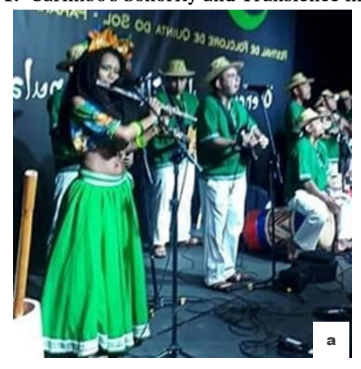
Figure 1: Carimbó's Sonority and Transience in Belenense Urban Space

The image a in figure 01 brings a dimension of the territoriality of Belenense carimbó as a spatial control project outlined by the discussion of gender roles in the repetition-innovation movement of cultural inventiveness<sup>9</sup> and political action on the spatial boundaries of female making that until then restricted to the body of dancers. This modifies the traditional structure of carimbó also in the traces of the garments, since, even maintaining the pattern of long skirts, ruffled blouses and extravagant flower arrangement in the hair, revise the printed flower matrix, which was verified, to a greater or lesser degree, in clothing from the seven groups. Still in the image, the uniformed musicians with straw hats can be seen in the background, plus the right in the image the musicians with string instruments and the curimbó, which can be varied in number when conducting the carimbó.