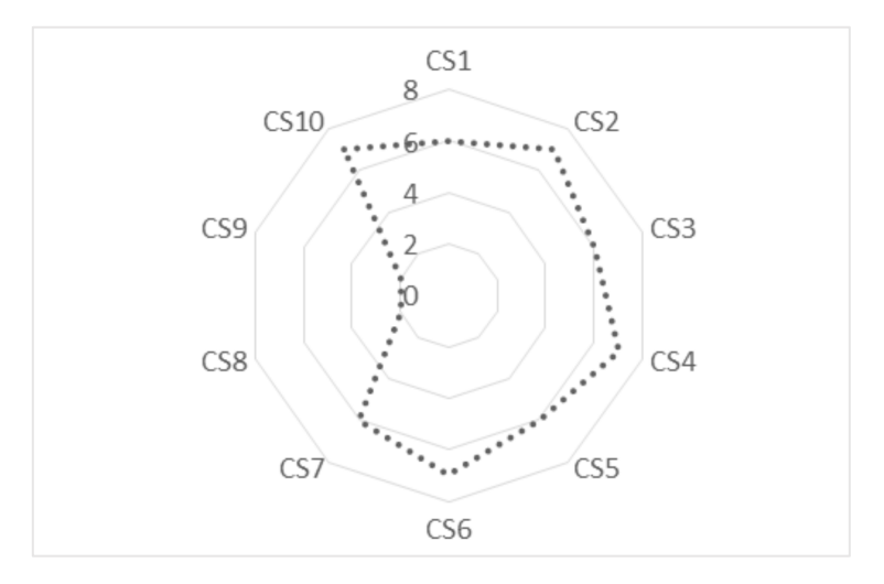
Figure 1 demonstrates the general performance regarding the current social indicators present in the sample concerning artisanal agro-industrialisation in the Federal District, in which, on the left, the total performance refers to each representative proposition and, on the left, on the right, the individual performance of each producer. The graphical representation follows the proposal of Ornstein (1989), which indicates that the Radar graphical representation favours the comparison of performance between variables.

Figure 1 - Social performance of the surveyed sample.