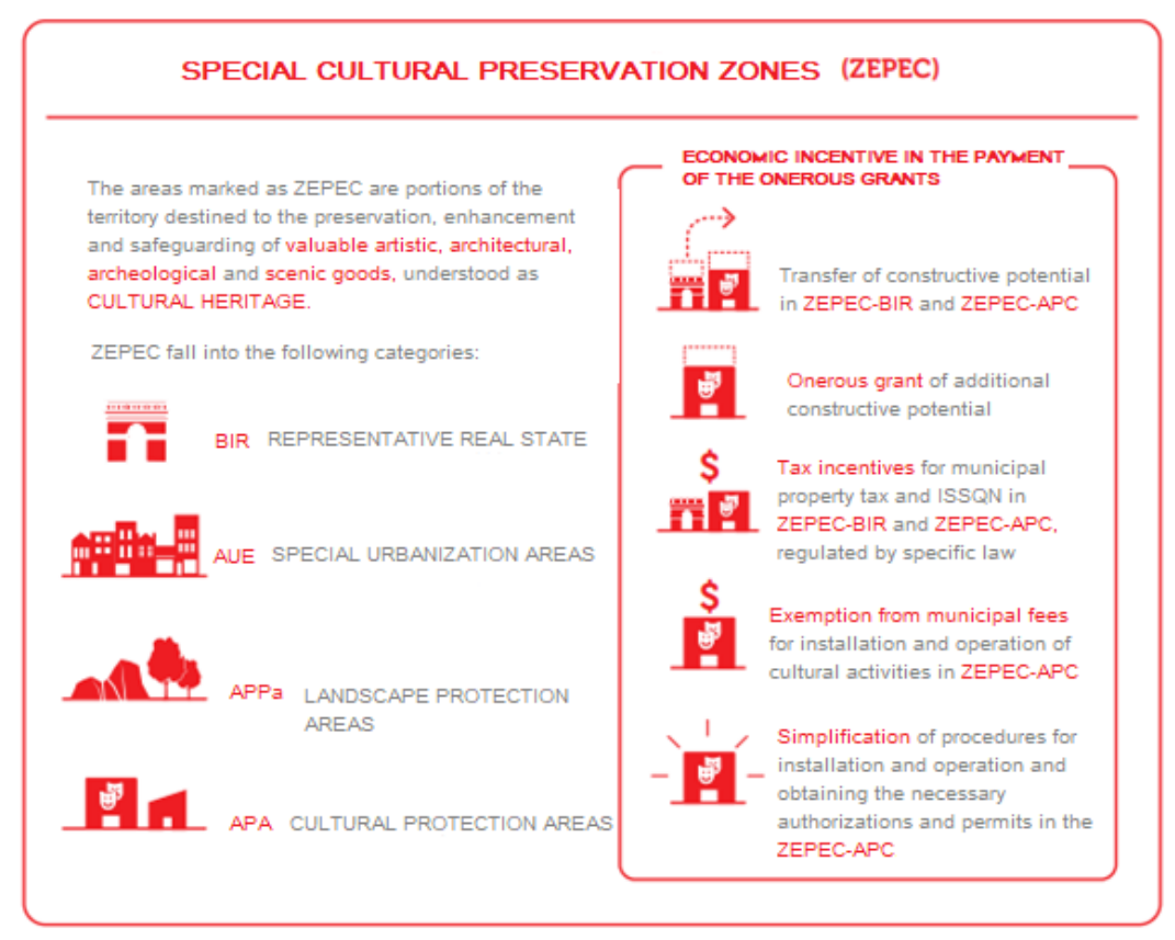
Figure 1: São Paulo Master Plan 2014