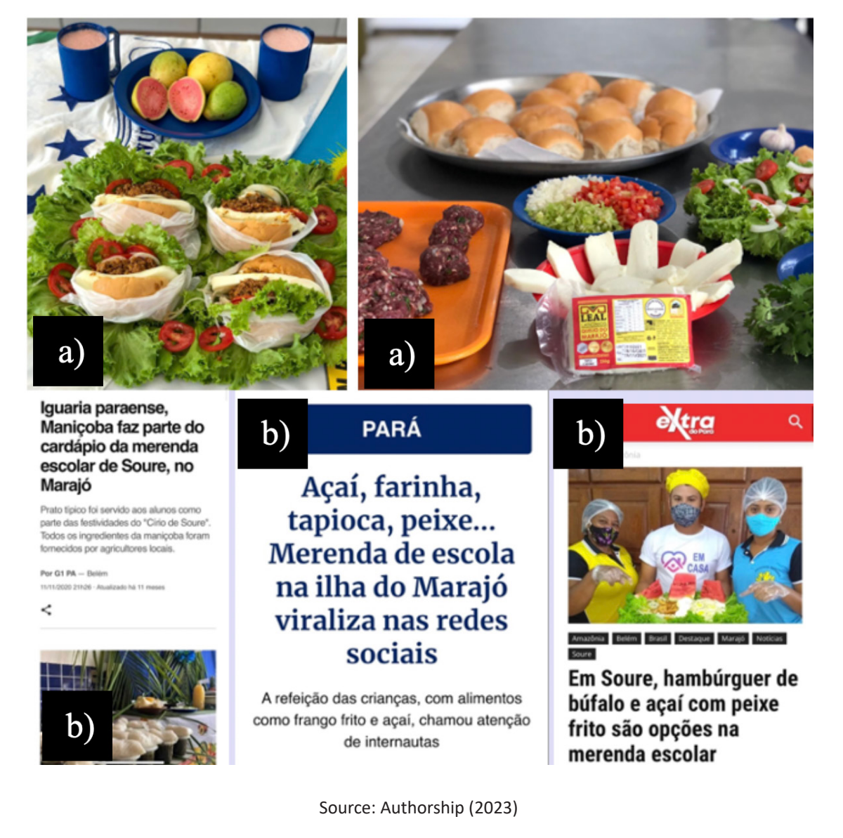
Figure 03 (a) Products from local fruit growing and buffalo milk production and (b) highlights of the initiative in the media.

Empirically, it was observed that the student community has positively evaluated the school meals provided in the municipal public schools of Soure, particularly the items on the new menu, such as açaí, maniçoba (a traditional dish), fish fillet, "Romeu e Julieta Marajoara" (a local sweet made with buffalo milk), and various other fresh products from local fruit production and buffalo milk: hamburgers, Marajó cheese, pasteurized buffalo milk, Marajó butter, and cheese bread (Figure 03).